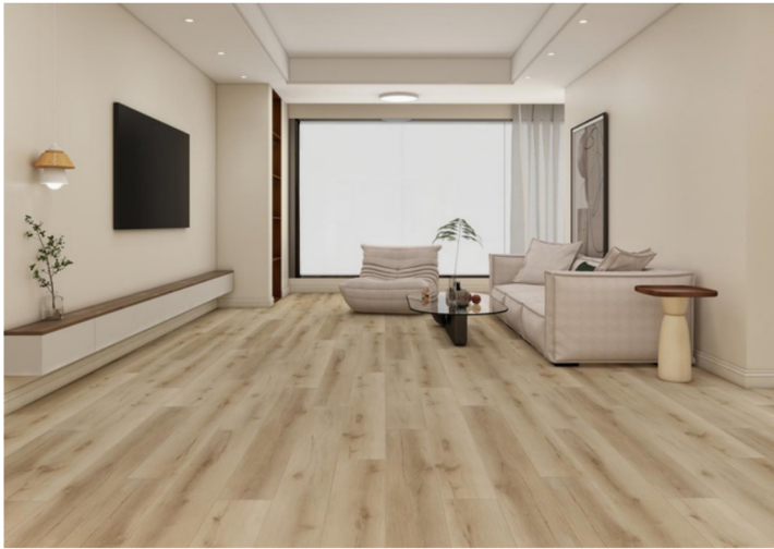
*LV crossover sku = DLV707 - Mercury Mist