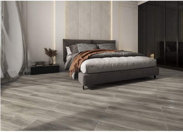
DEV704 - George Grey