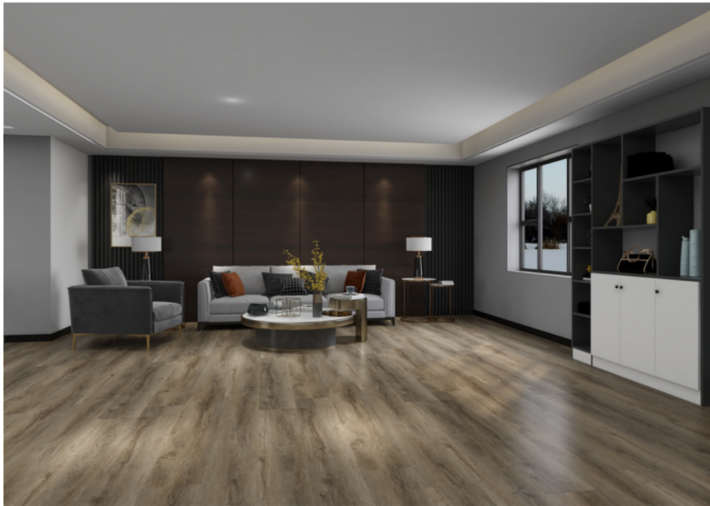
*LV crossover sku = DLV 908 - McCartney Mocha