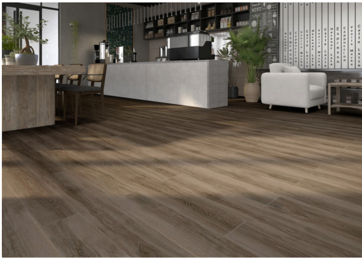
DEV701 - Rod Iron Wolfgang