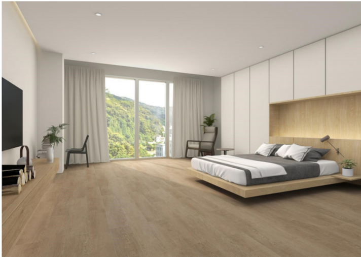
DEV705 - William Desert

*LV crossover sku = DLV04 - Gershwin Grey