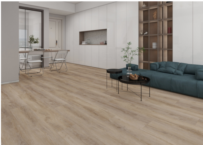
*LV crossover sku = DLV909 - Grande Grey