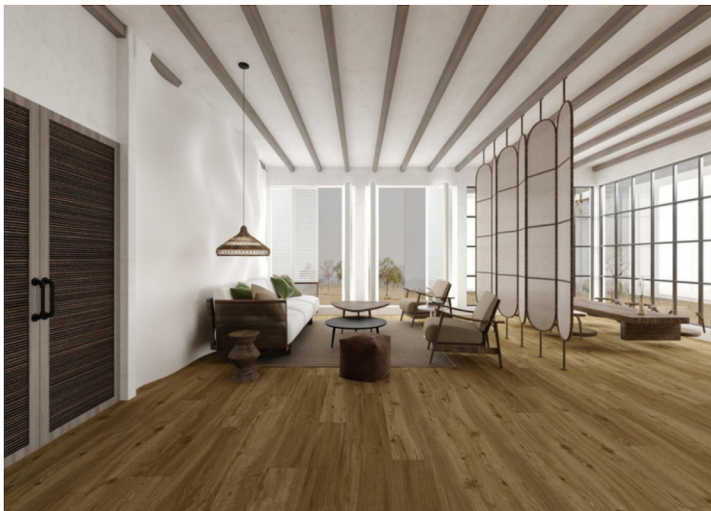
DEV702 - Ludwig Beige

*LV crossover sku = DLV701 - Midnight Mozart