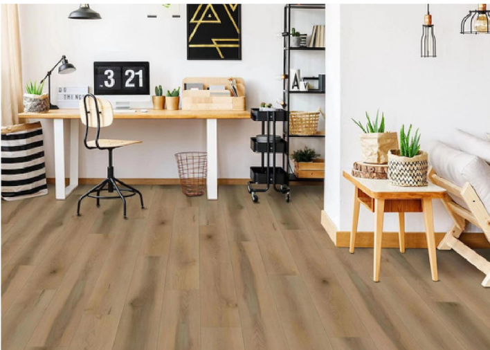
DEV706 - Fredrick Maple

*LV crossover sku = DLV705 - Coastal Byrd