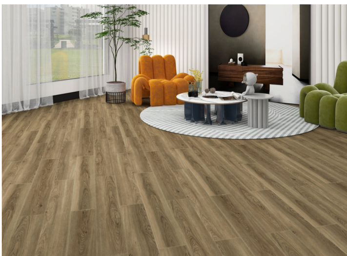
DEV703 - Johann Brown

*LV crossover sku = DLV702 - Beethoven Beige